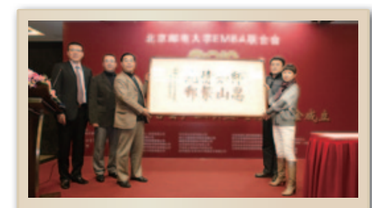
Initial students of EMBA studied in 2009 offer present to School of Economics and Management of Beijing University of Posts and Communications